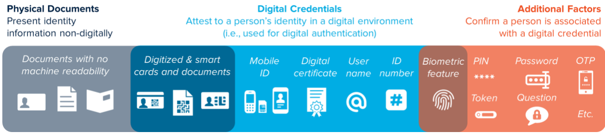
Figure 1 - Examples of credentials and authenticators commonly issued by foundational ID systems<sup>3</sup>

The World Bank describes the evolution this way: "As societies become more digital, we have begun to see a move toward digital-only ID systems that do not rely on the possession of a physical credential." Digital credentials offer a more dynamic set of information, easily updated and expanded to meet the needs of the moment. With so much data becoming readily available, it is an understandable next step to use that data in new and creative ways, with increasing implications for individual privacy.